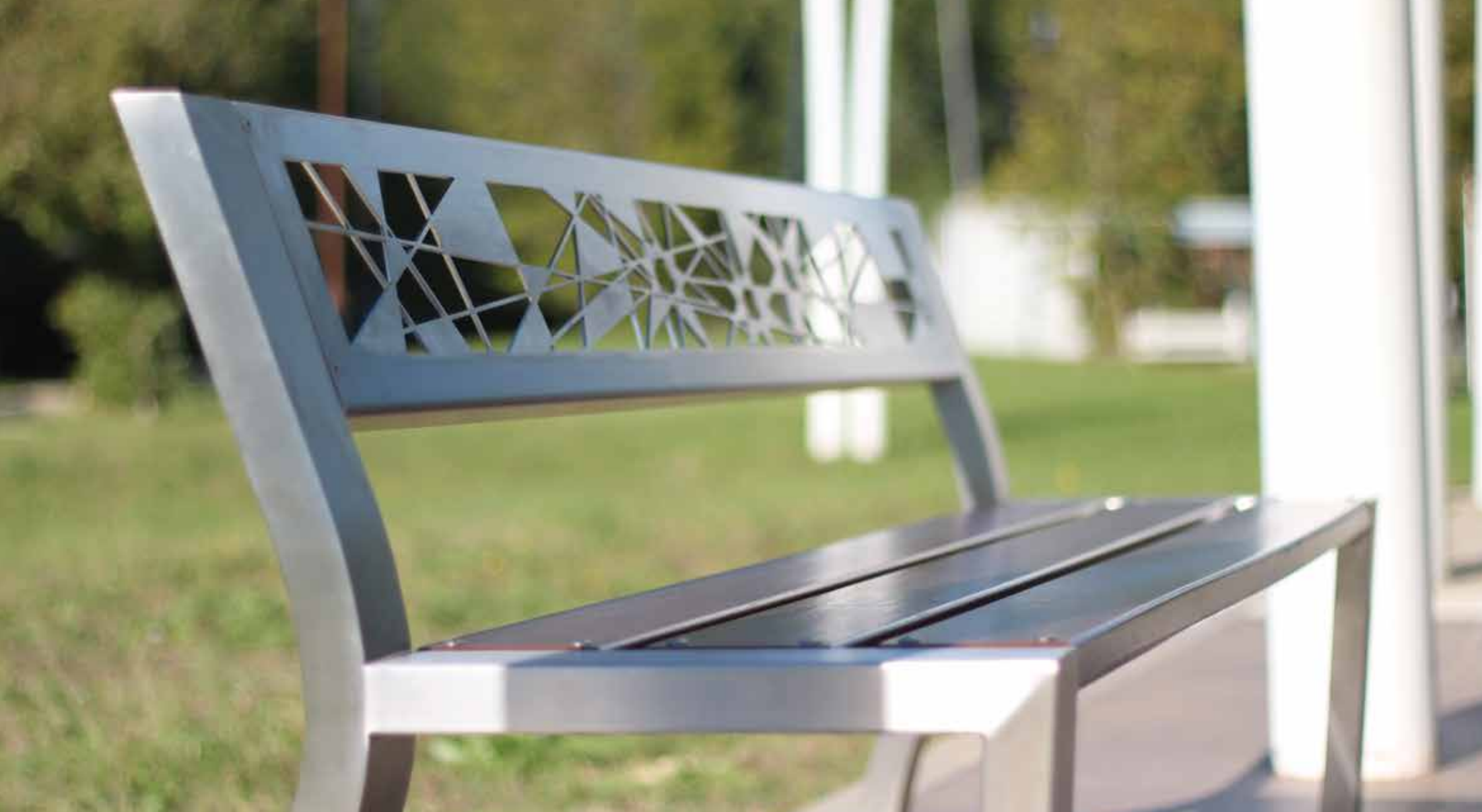
Stainless steel and Iroko wood bench