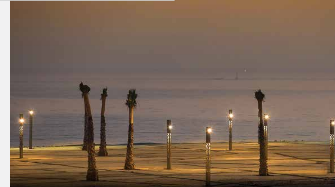
Marocco Tangeri project